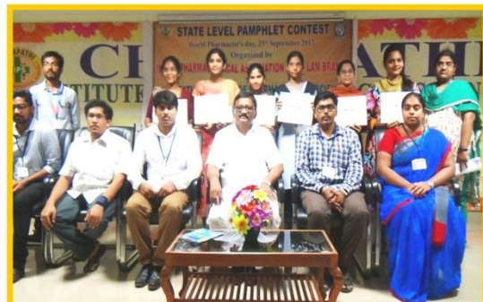
IPA LAM branch organized state level pamphlet competition on 25 th September 2017