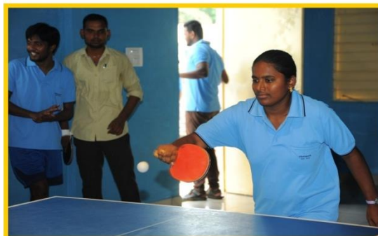
CLPT organized ANU Intercollegiate Table tennis competitions for men and women on 15 th & 16 th September 2017