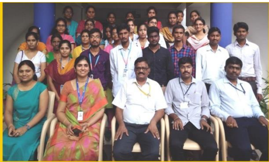
Placement drive conducted by Biophore India Pharmaceuticals Pvt. Ltd, Hyderabad on 6 th November 2017