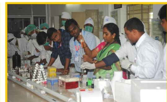
Dept of Pharmaceutics organized hands on training on Cellular and Molecular Biology Techniques on 3 rd and 4 th November 2017