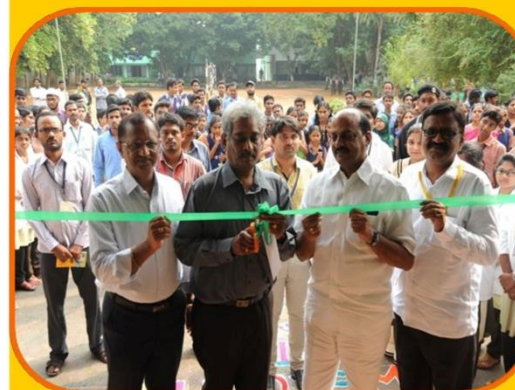
Inauguration of 13 th Pharma Science Exhibition