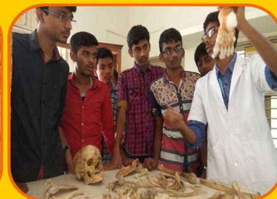
13 th Pharma Science Exhibition exhibits