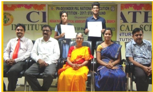
IPA - Devinder Pal National Elocution State round competition was organized on 2 nd November 2017