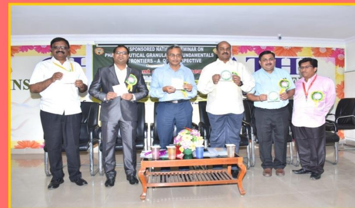
Department of Pharmaceutics organized AICTE sponsored national seminar on Pharmaceutical Granulation: Fundamentals and Frontiers - A QbD Perspective on 29 th & 30 th November 2017.